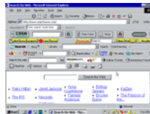
Toolbars running on Internet Explorer

Many other ActiveX components were installed from malicious sites. In addition, m cookies which track online activities. Below is a screenshot of Internet Explorer wit visible and one of the desktop which reveals many of the programs that were insta is my sister's computer once looked like this.